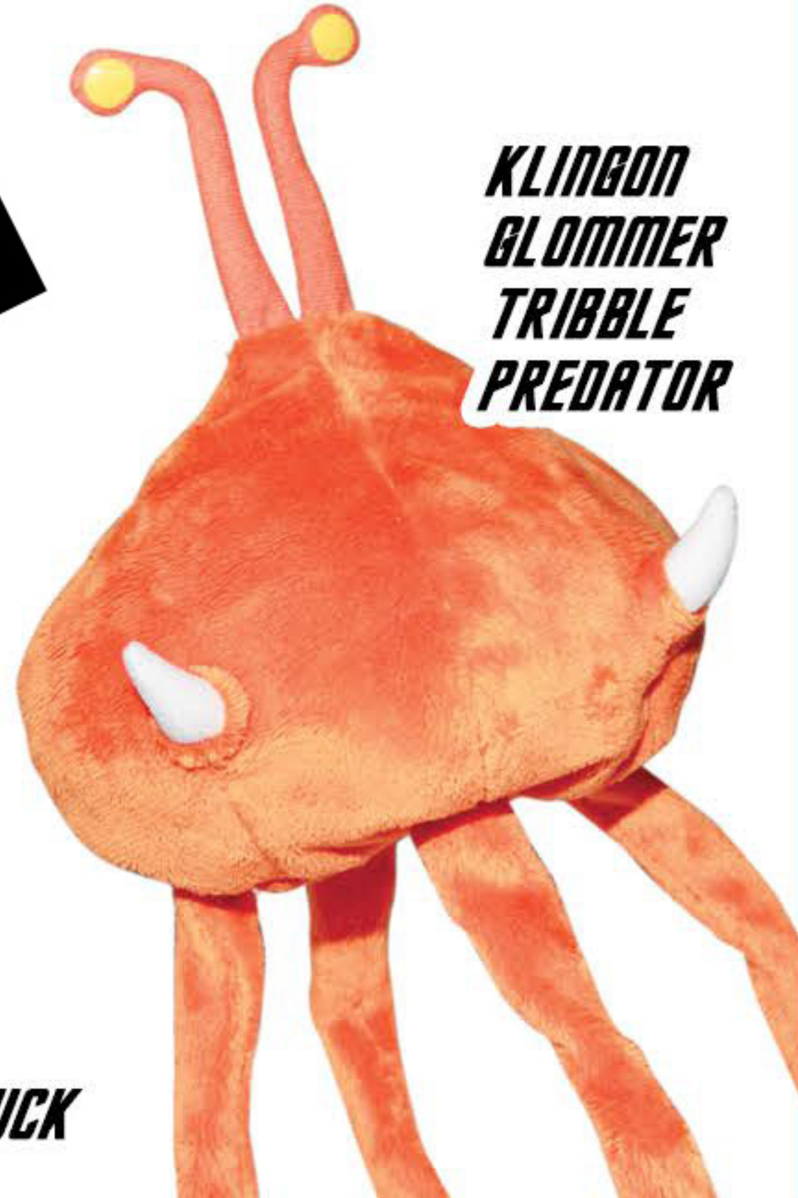
KLINGON BLOMMER TRIBBLE PREDATOR