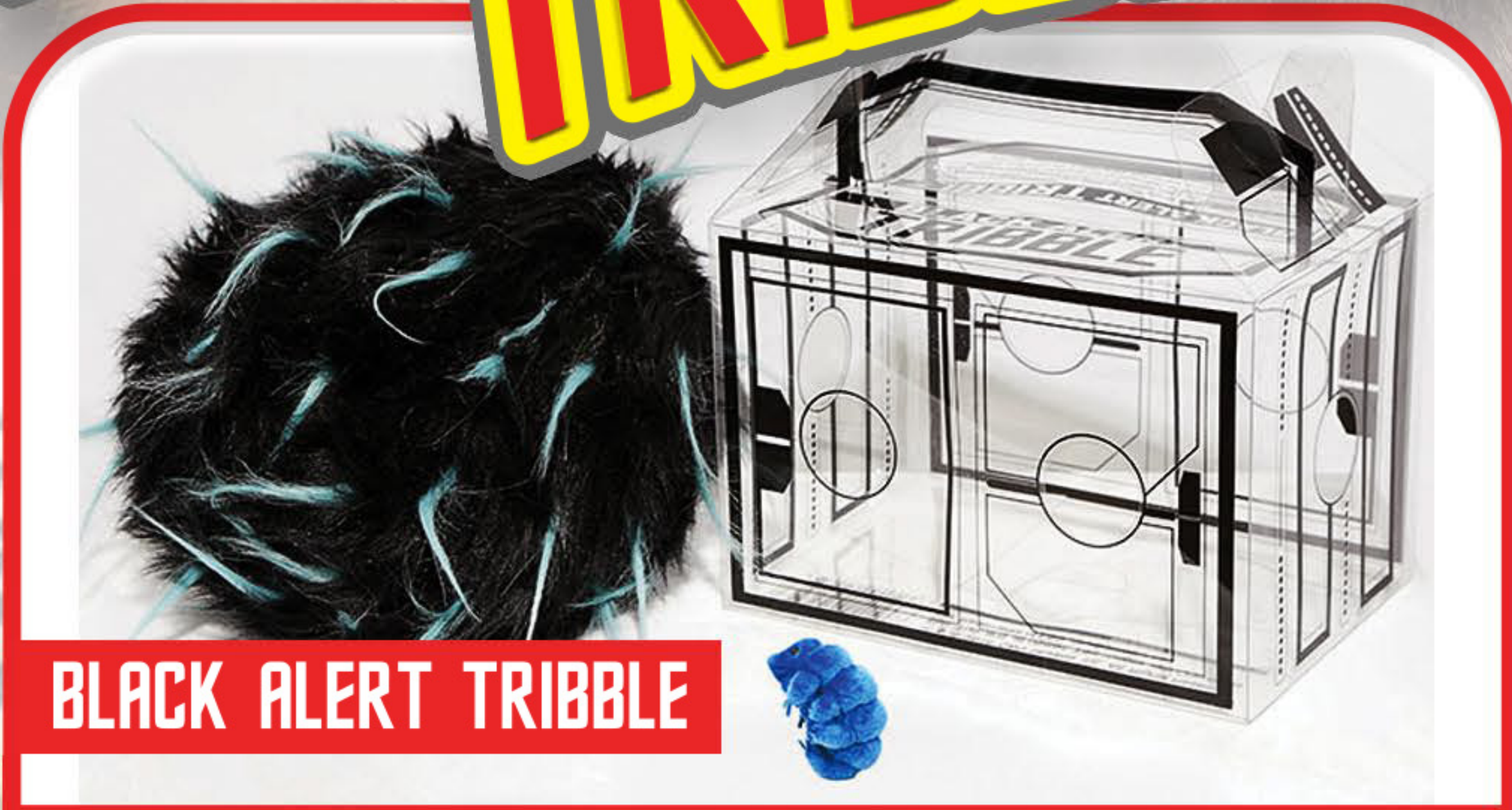
BLACK ALERT TRIBBLE

In 2256, Lorca and Landry conducted tests to determine whether certain fauna could be used against the Klingons. Some TRIBBLES reacted positively to mycelial spores, resulting in a beautiful fur pattern!