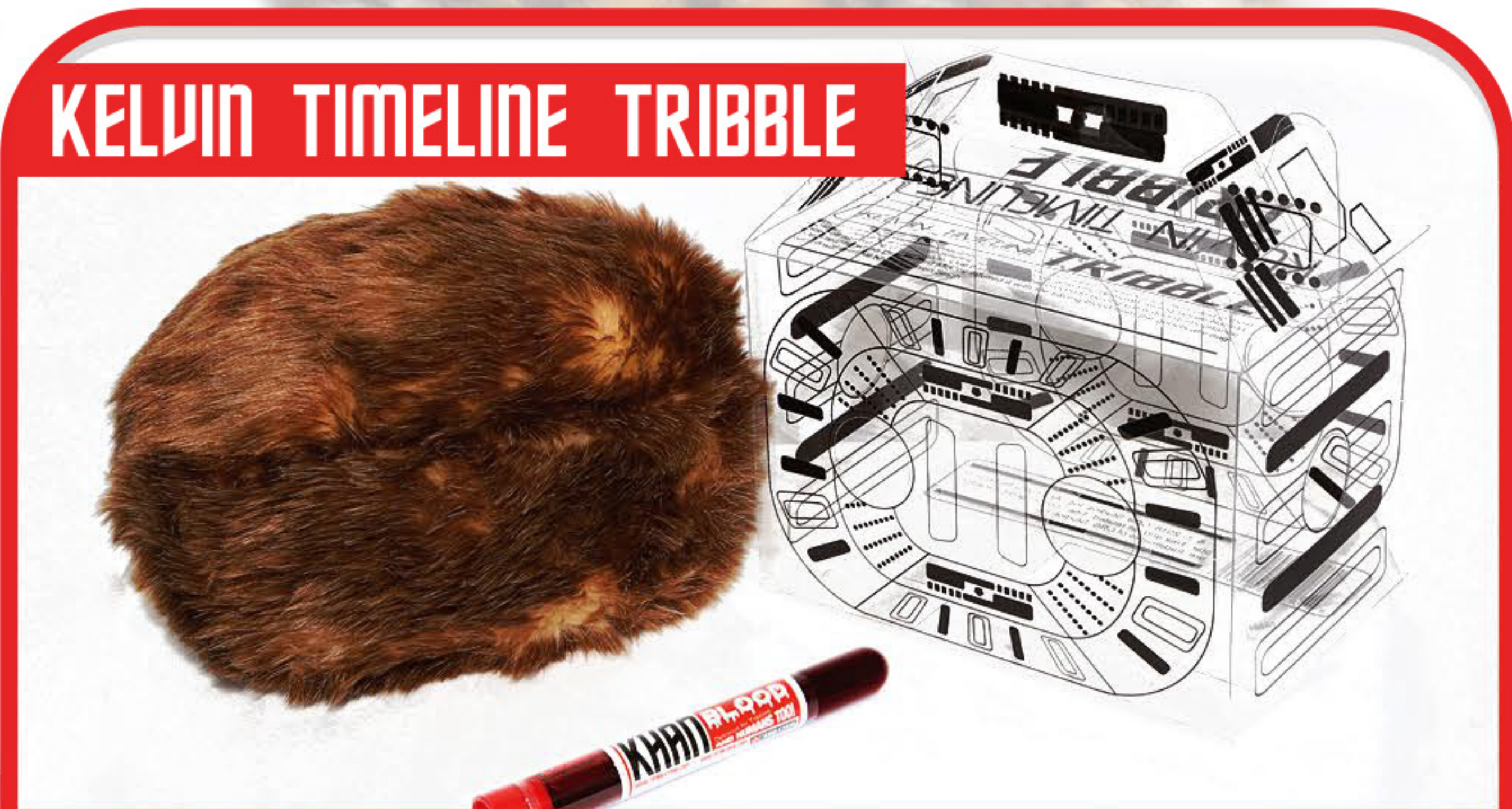
KELVIN TIMELINE TRIBBLE

TRIBBLES exist in most realities, including an alternate timeline spawned in 2233 when the Narada faced off against the Kelvin. A TRIBBLE proved to be of great historical importance in this reality, when McCoy infused it with life-saving "Khan blood"!