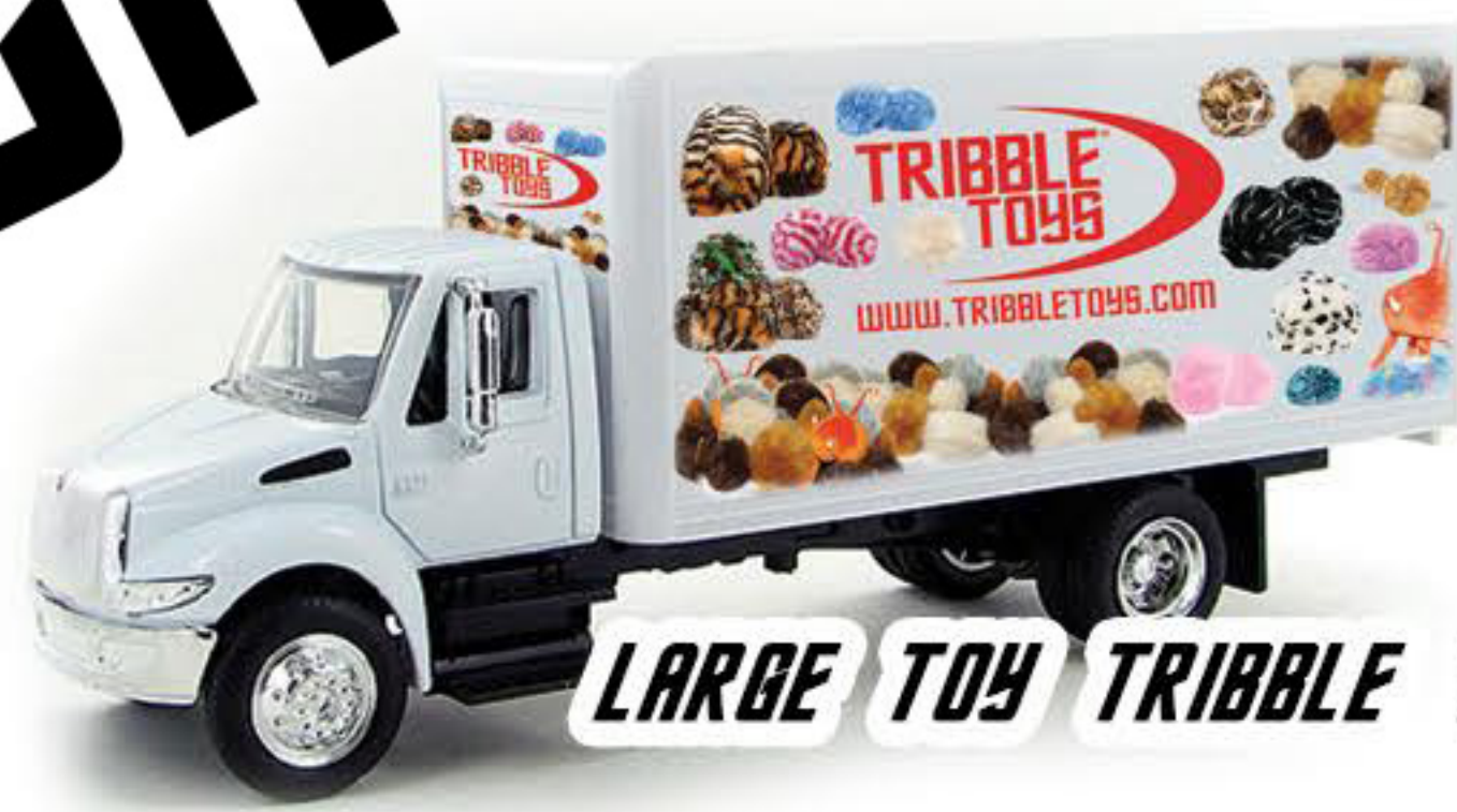
LARGE TOY TRIBBLE TRUCK